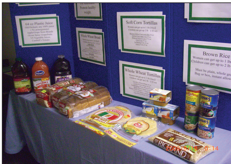
Samples of foods which can be purchased with WIC vouchers